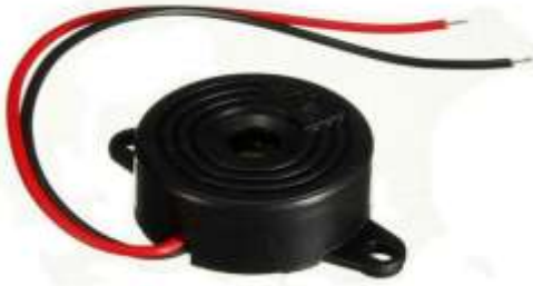
Fig 3: Buzzer

A piezoelectric buzzer is a type of electronic buzzer which works or drives by the electronic circuit which is in the oscillating motion. This type of the buzzer can also be work by the other audio signal sources. This piezoelectric buzzer can also drives by the audio utilized amplifier. This buzzer is which is most commonly or most preferred buzzer that has to be pressed or Or it has the click or the ring or the beep to press and this provide the sound